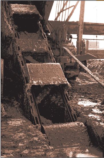
Terminal Island, CA